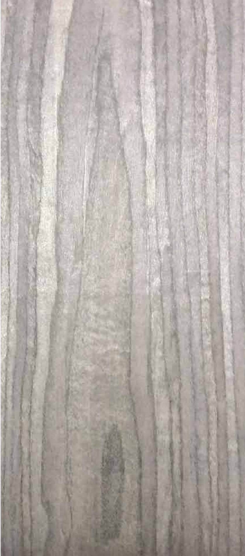
ELM SLATE GREY