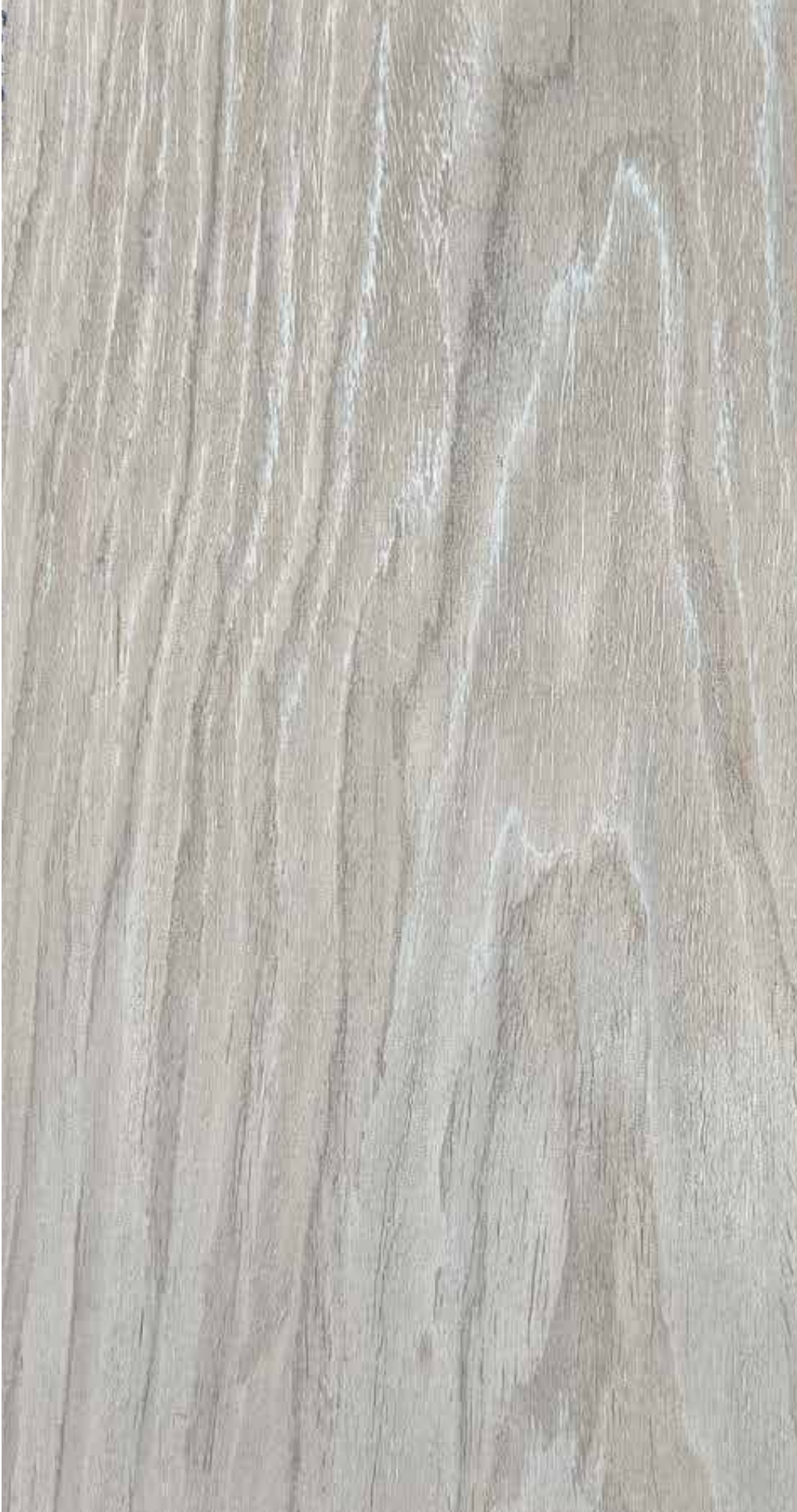
OAK PALE BEIGE