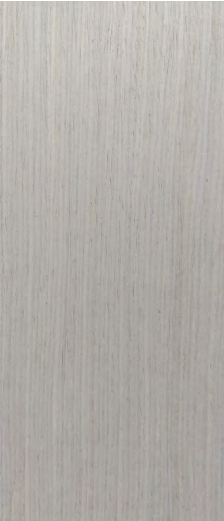
OAK PEARL WHITE