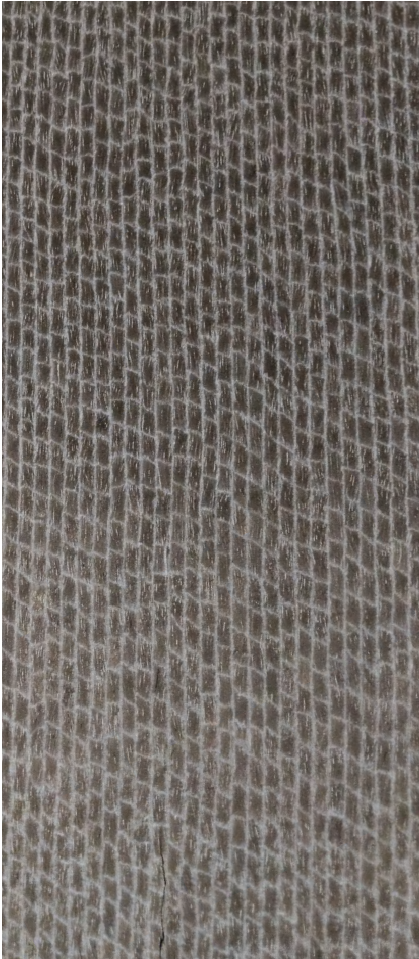
OYSTER QUILL GREY