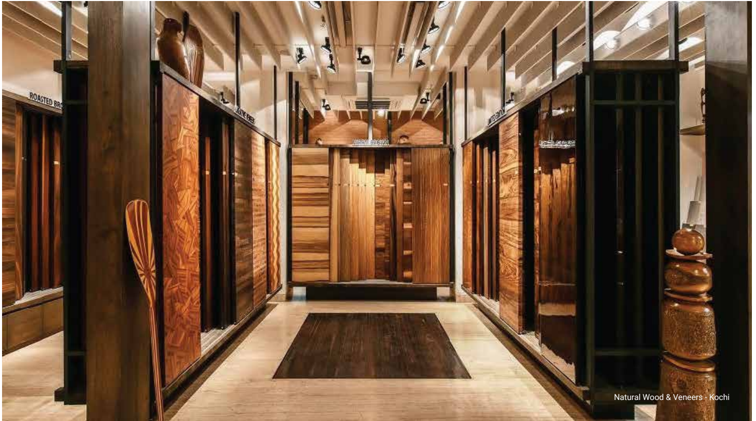
Natural Wood & Veneers - Kochi

Established in 1977, Jalaram Timber Depot started with a simple mission – to preserve the quality and craft in harvesting the finest wood from around the world and to bring it to India in its most suitable form to find a place in your home or work environment.