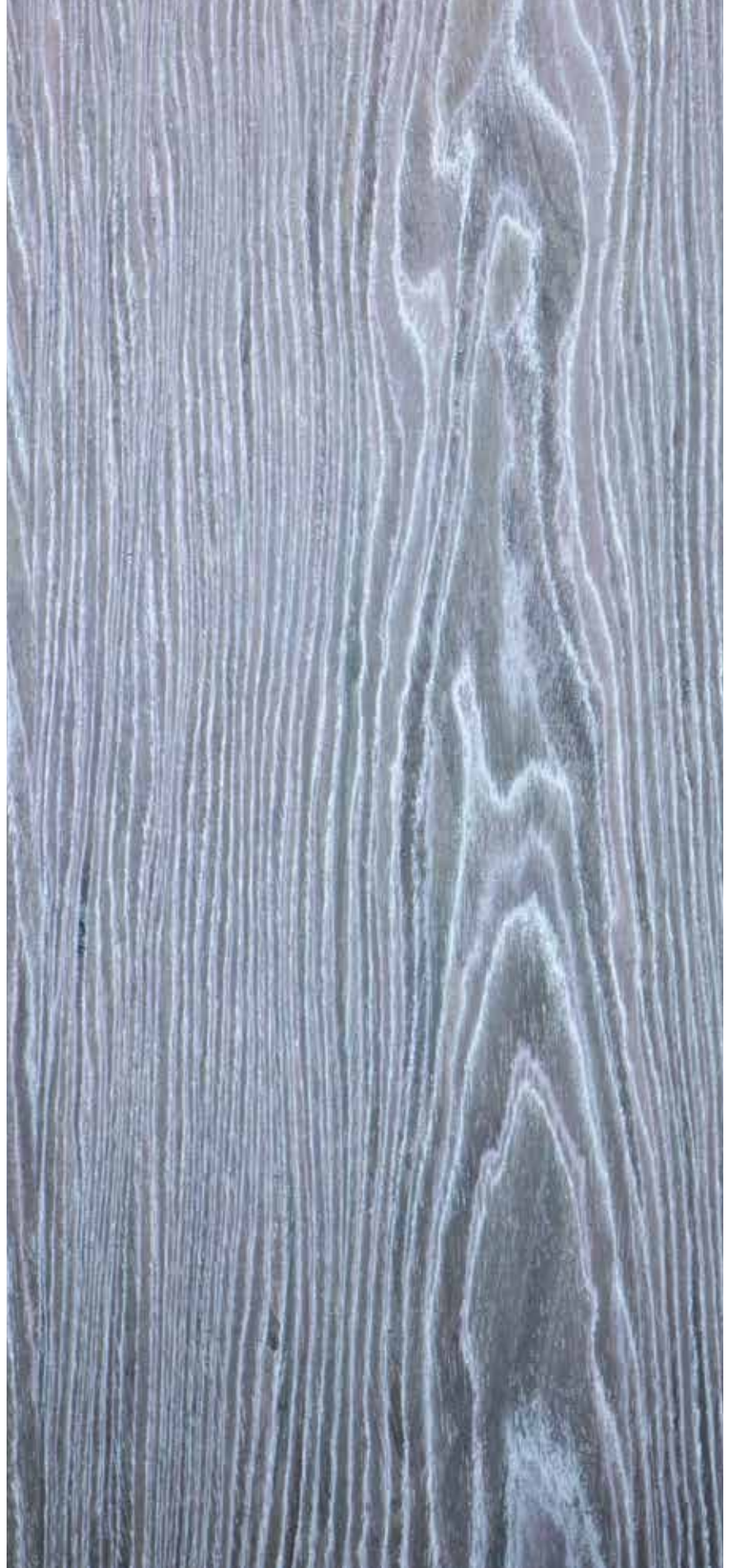
ASH PEARL GREY