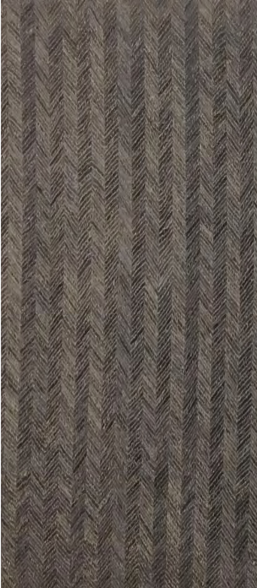
CHEVRON AMBER GREY