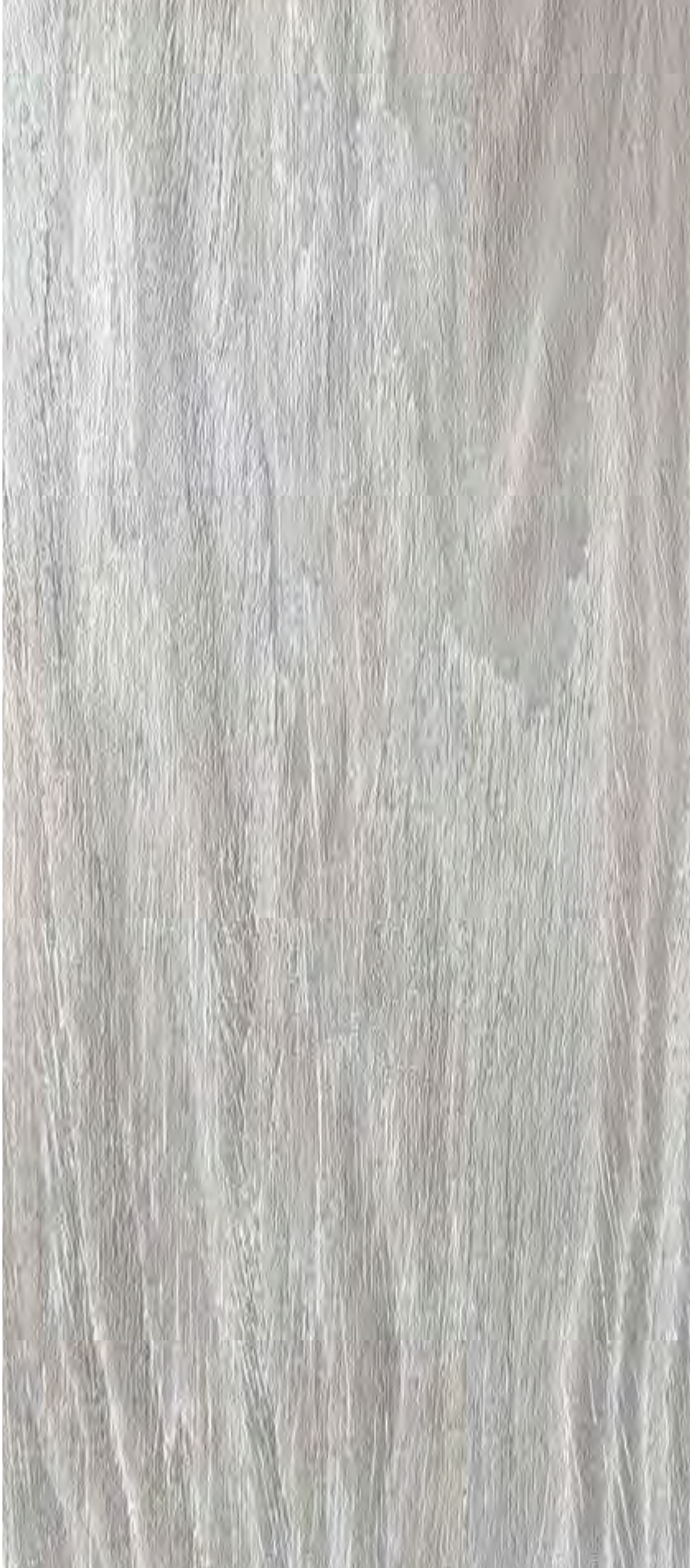
ASH FRENCH GREY