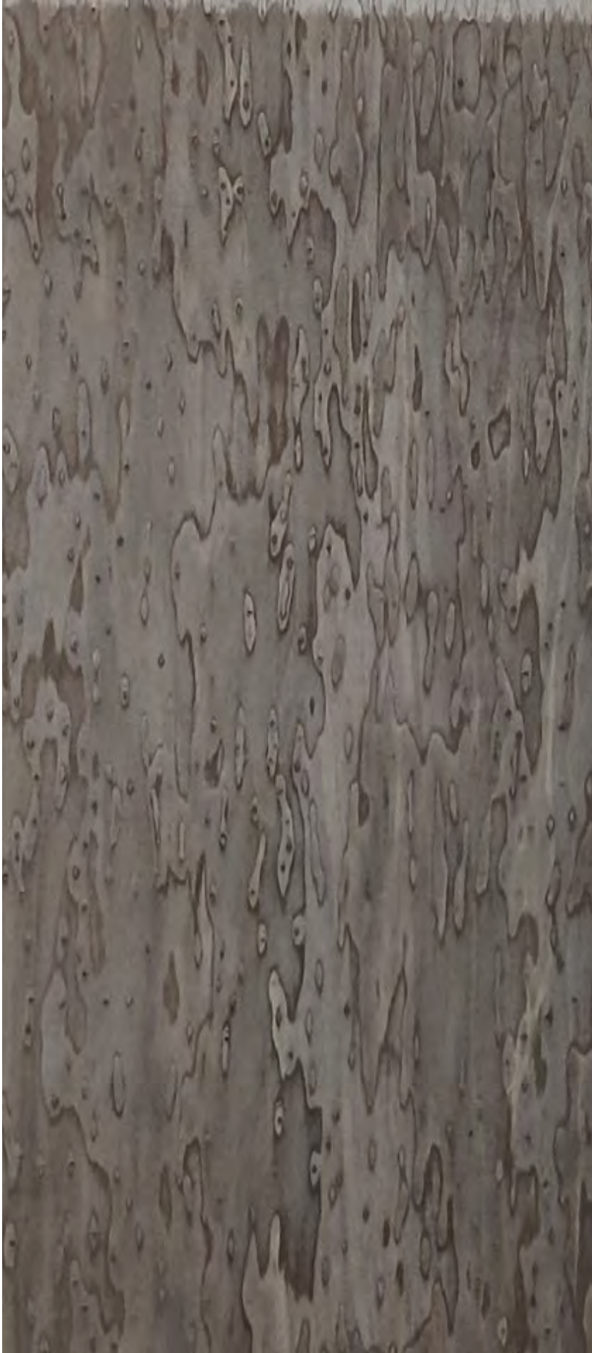
ERABLE HARBOR GREY