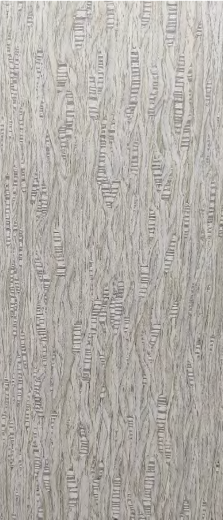
FABRIC MIST GREY