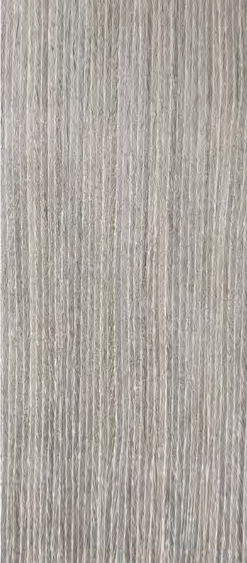
ASH SILVER BLACK Q