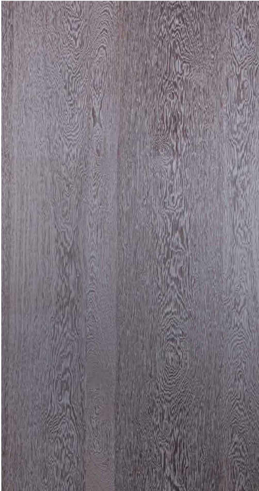
SUCUPIRA GREY VELVET