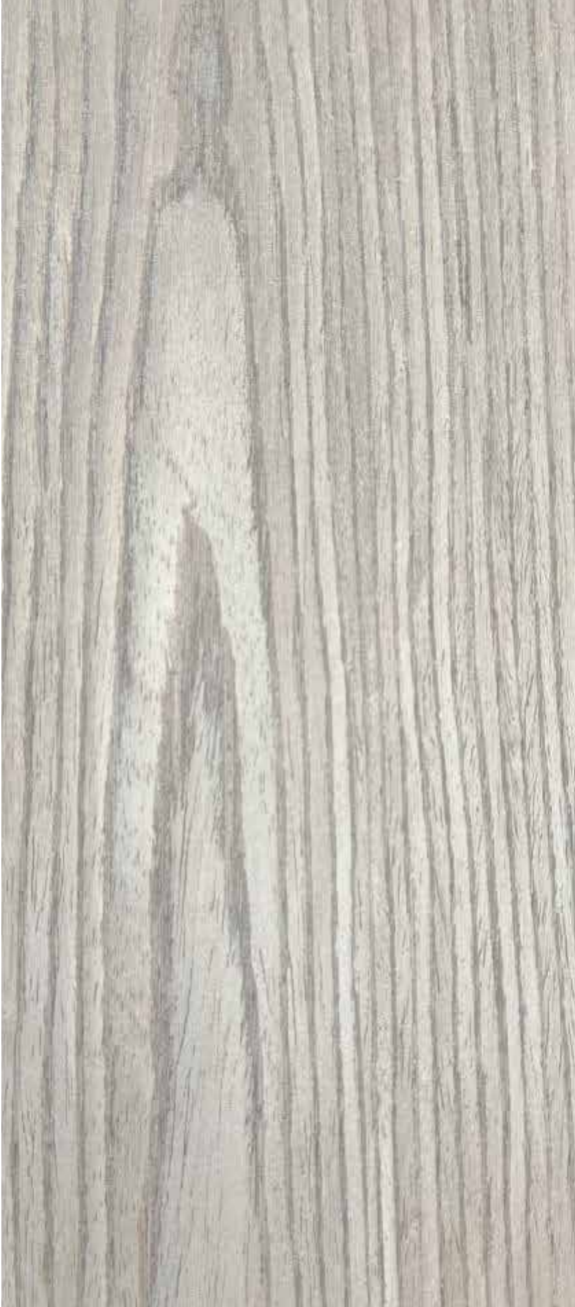
ELM EARTH WALNUT