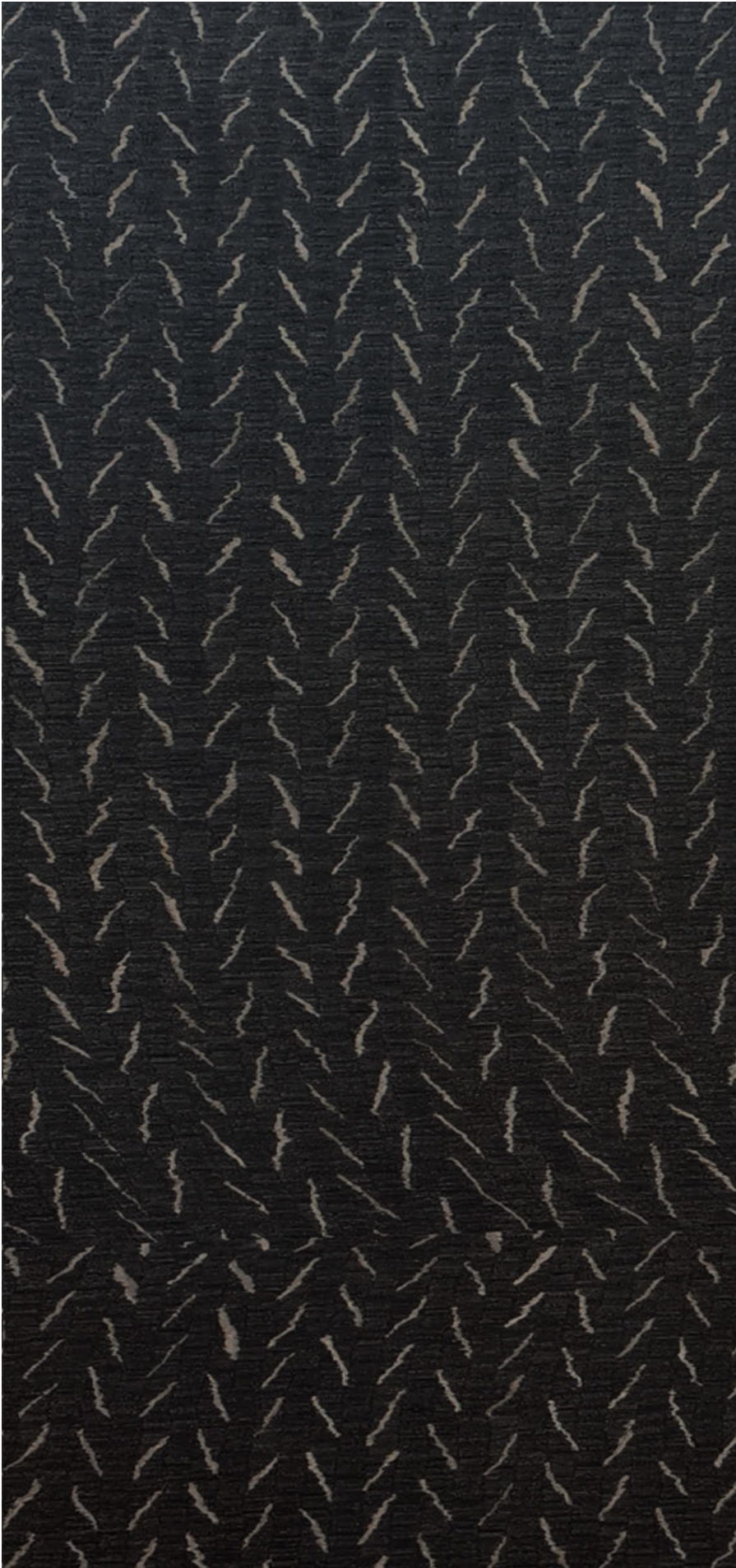
BALTIC ICE HORIZONTAL