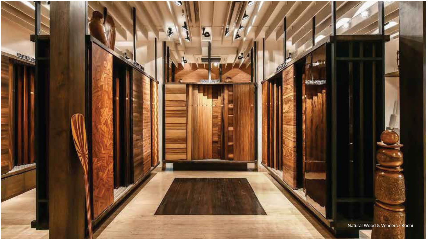
Natural Wood & Veneers - Kochi

Established in 1977, Jalaram Timber Depot started with a simple mission -- to preserve the quality and craft in harvesting the finest wood from around the world and to bring it to India in its most suitable form to find a place in your home or work environment.