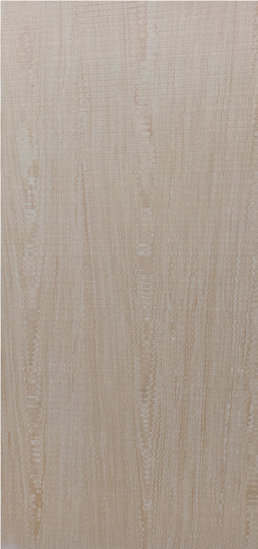
SAND OAK SERRATED