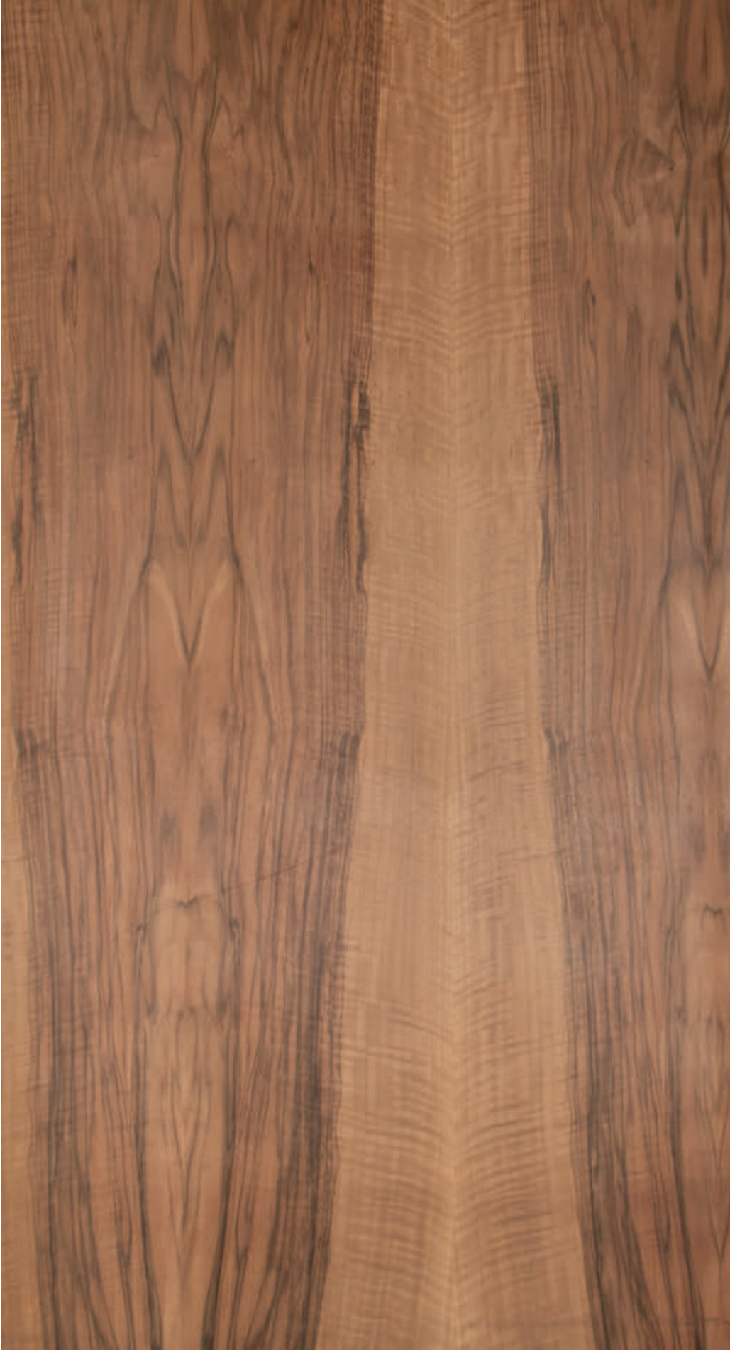
KASHMIRI WALNUT (1)