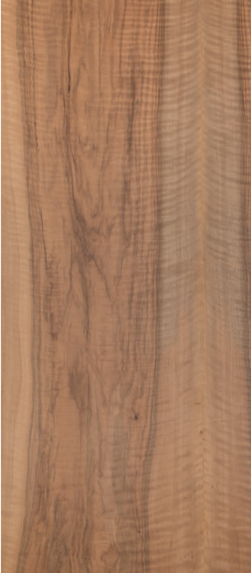
KASHMIRI WALNUT (3)