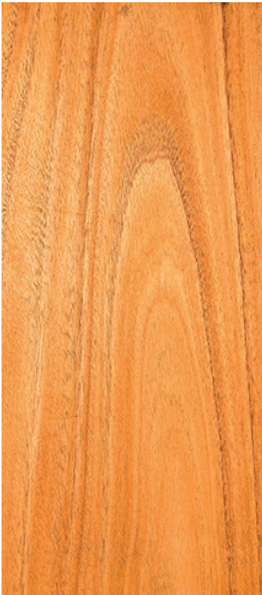
GOLDEN CEDAR FC (2)