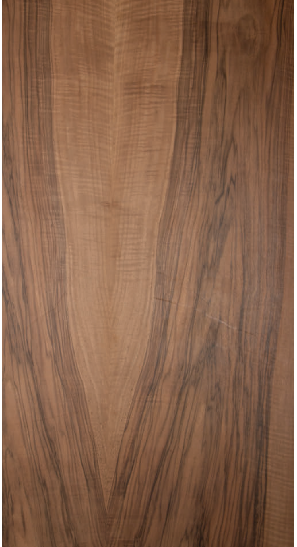
KASHMIRI WALNUT (2)