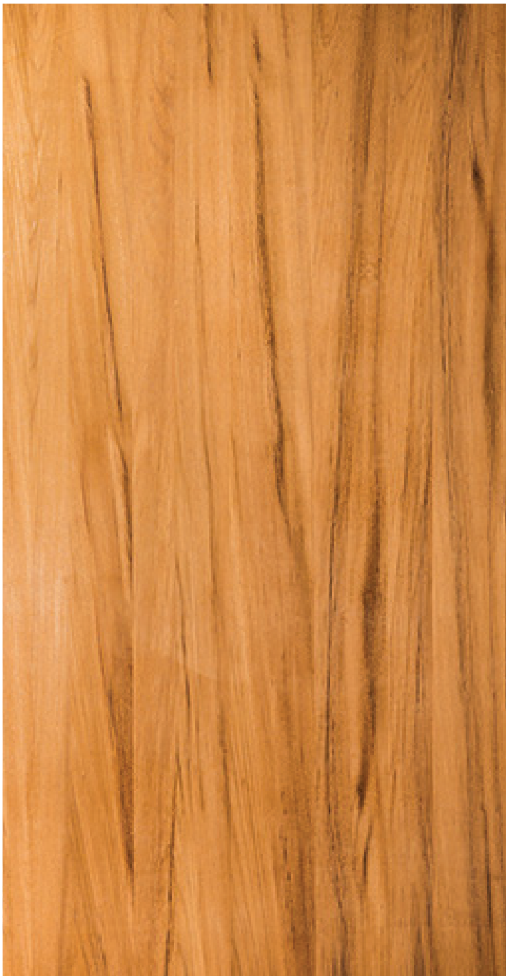
VINTAGE TEAK RM (2)