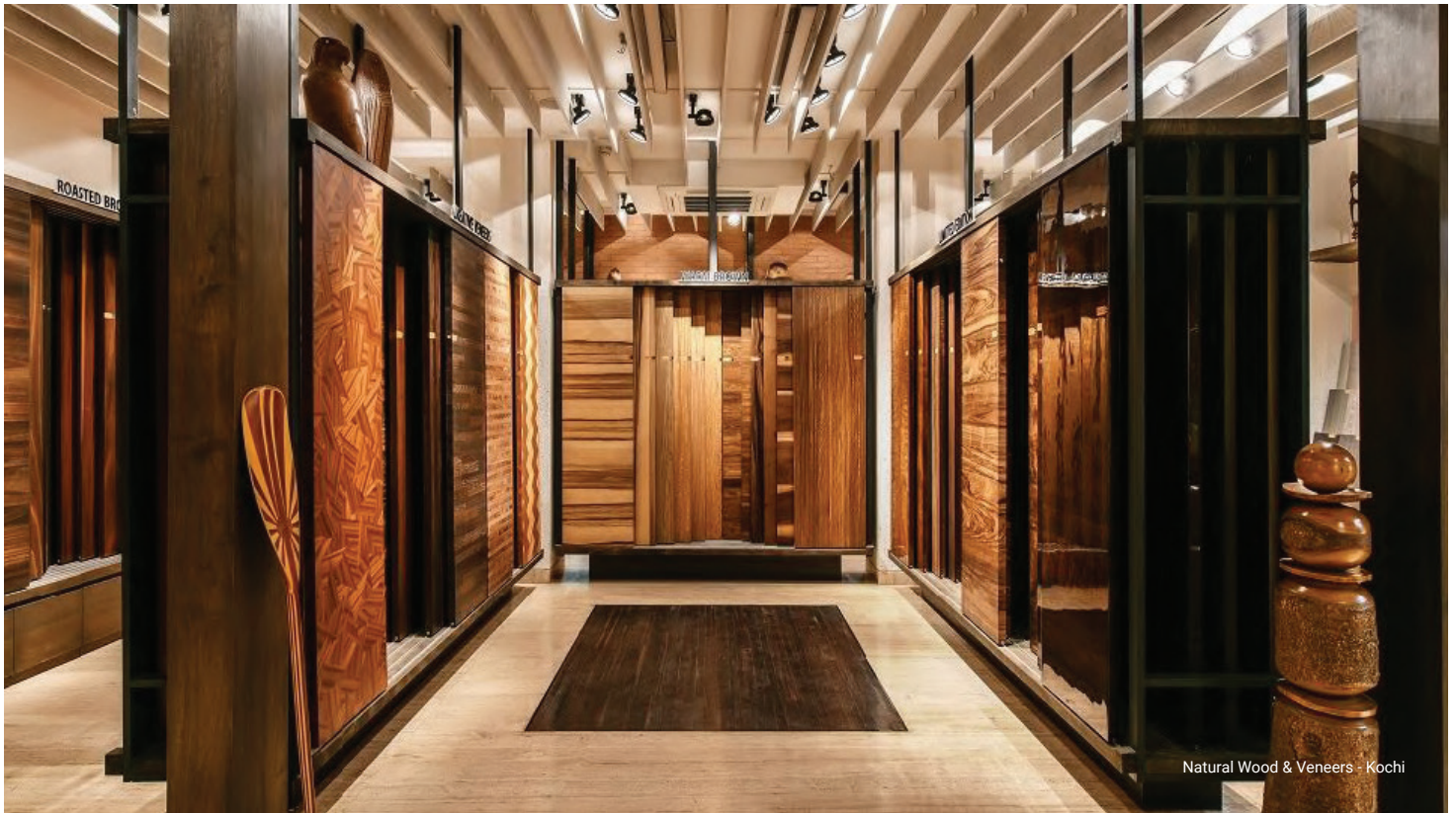
Natural Wood & Veneers - Kochi

Established in 1977, Jalaram Timber Depot started with a simple mission – to preserve the quality and craft in harvesting the finest wood from around the world and to bring it to India in its most suitable form to find a place in your home or work environment.