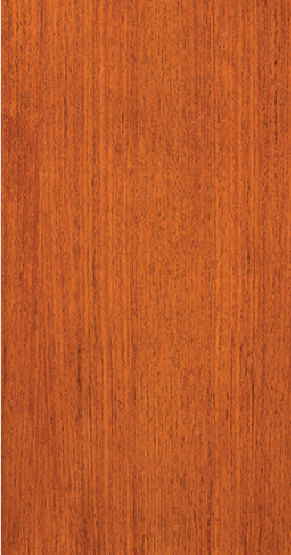
RED CEDAR Q