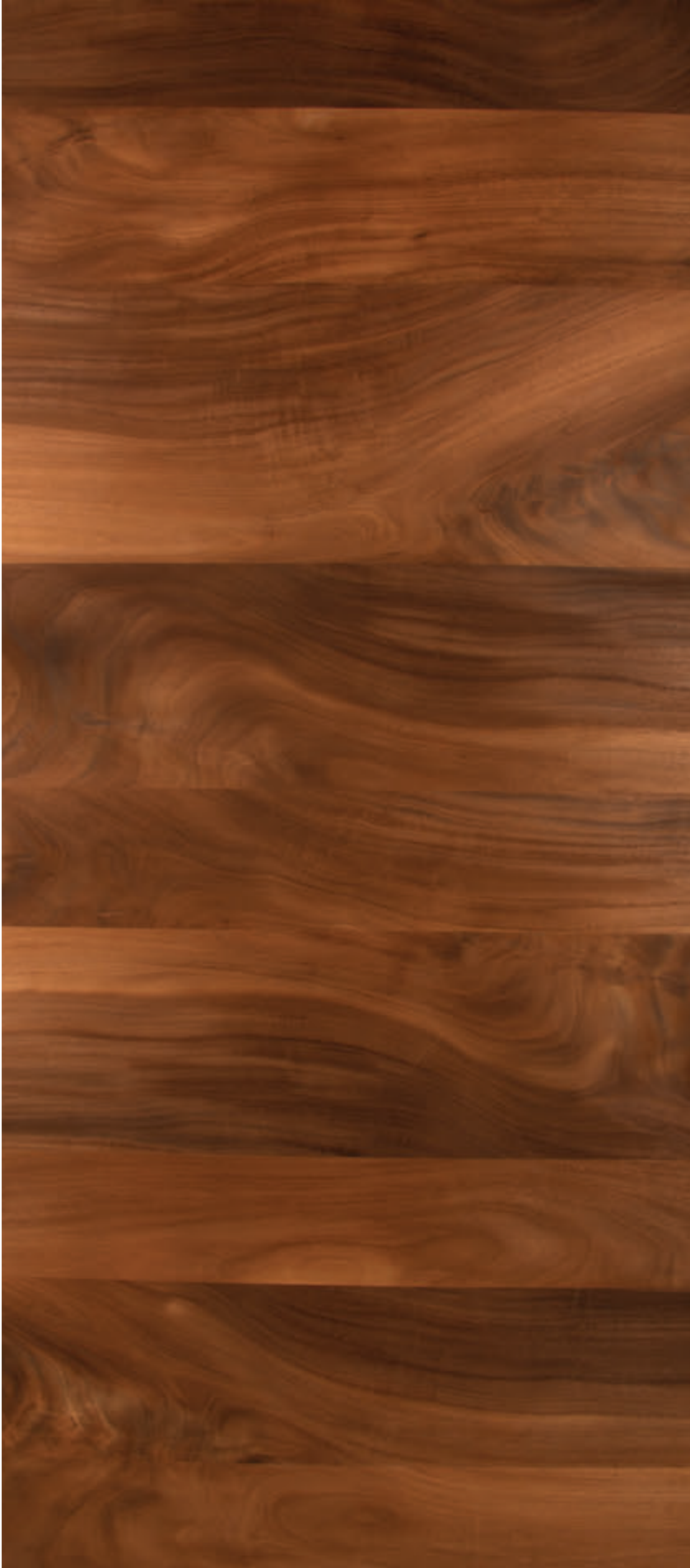
FM. LEBANESE CEDAR CROTCH