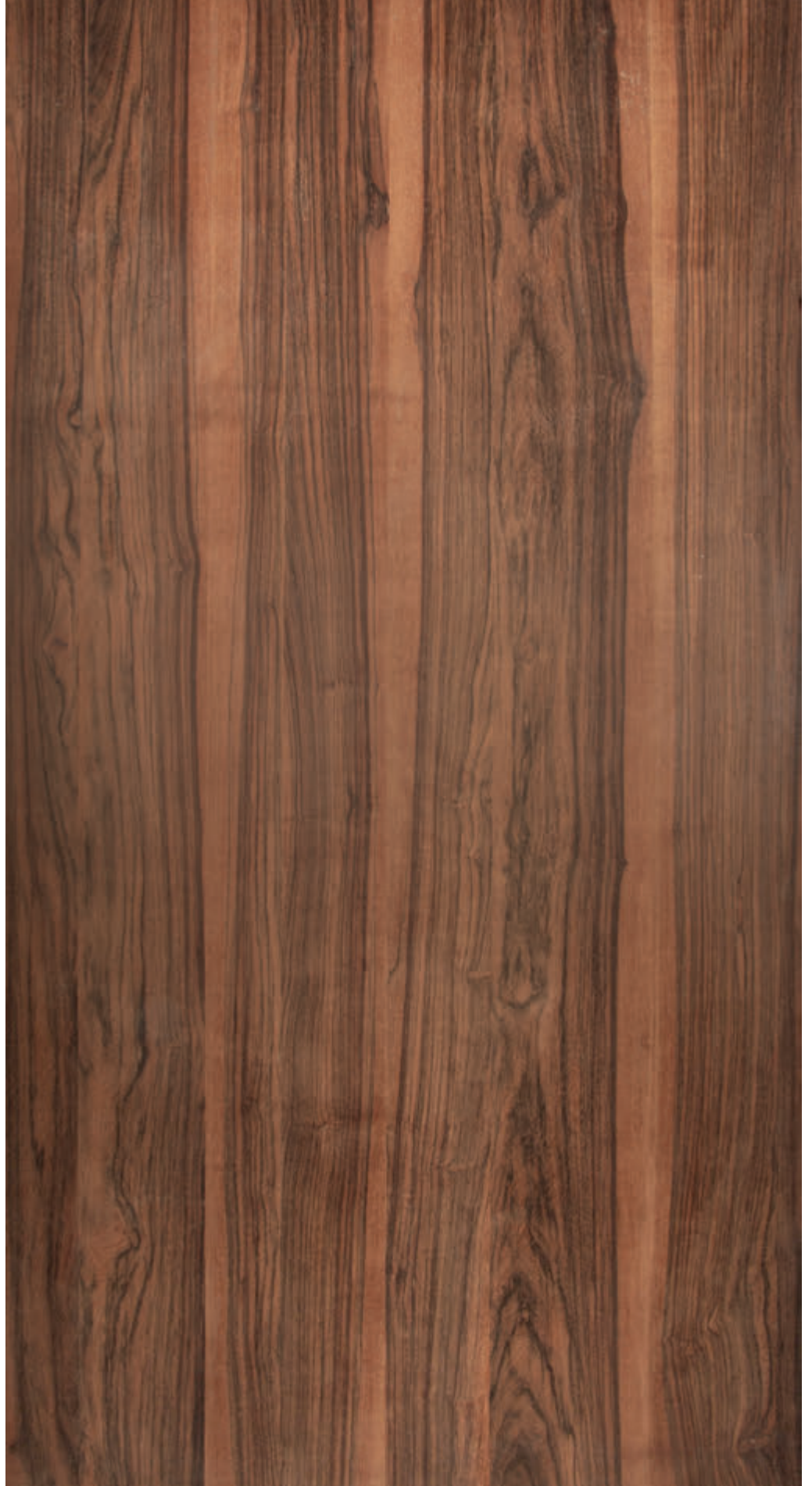
LAURAL WALNUT 2