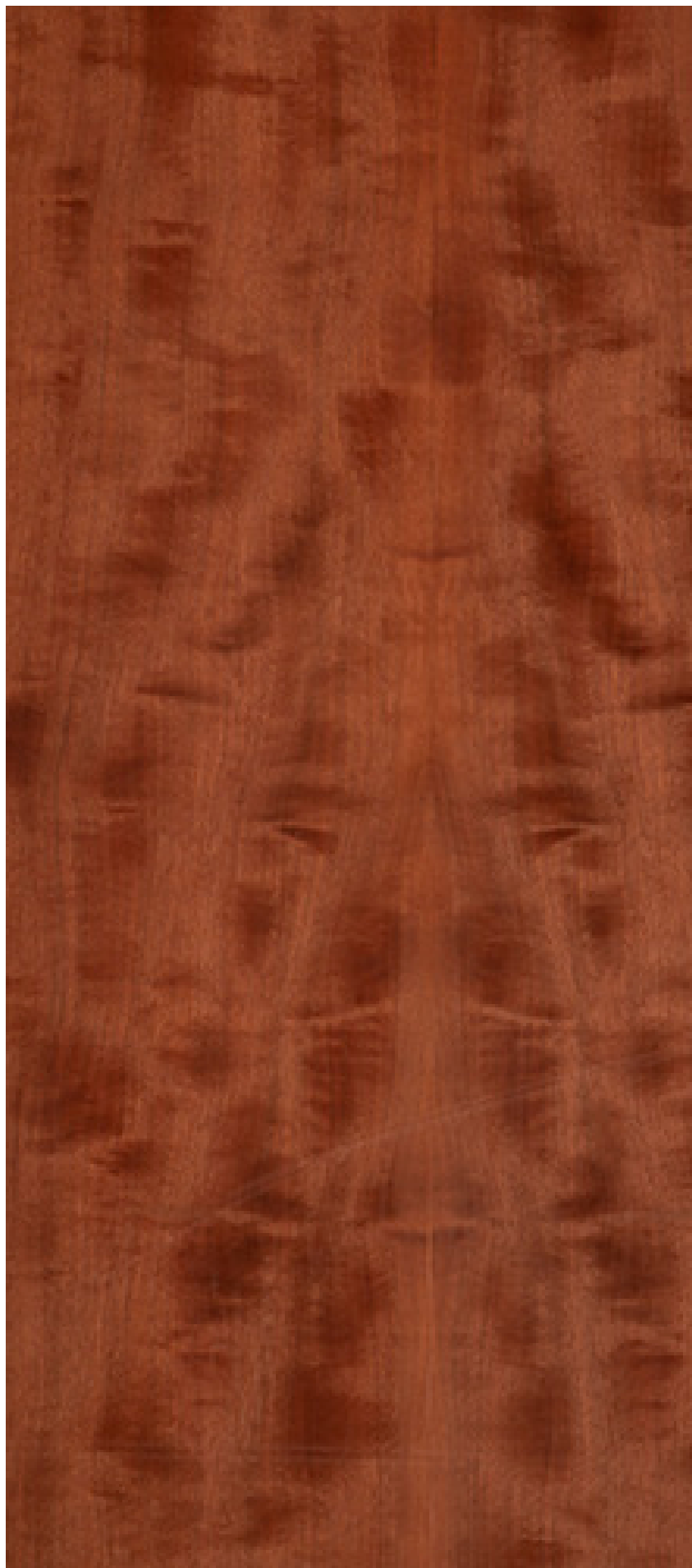
MAKORE BLOCK FIGURED