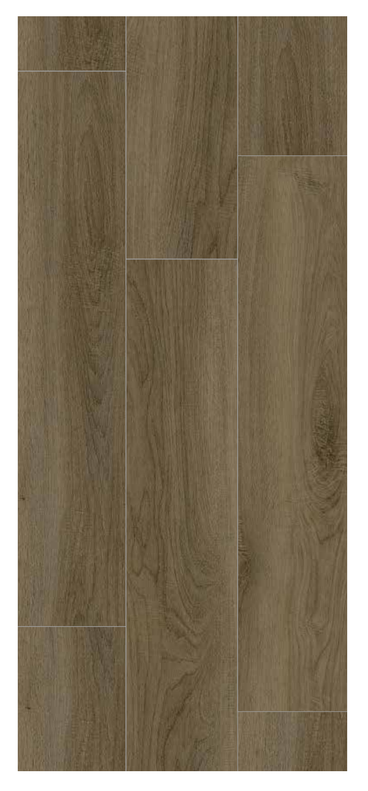
1124_Lily Oak Brown