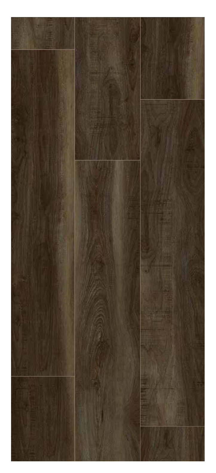
2102_Kati Oak Coco