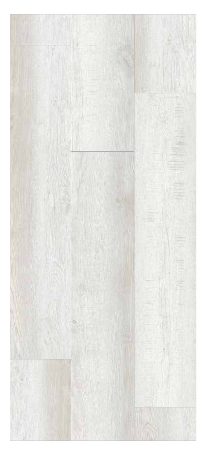
1126_Boston Oak White