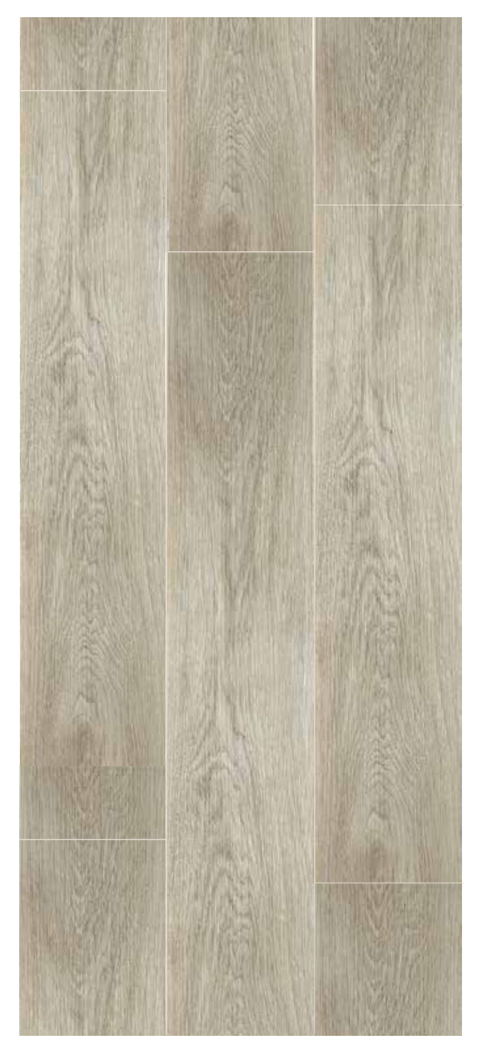
1132_Canyon Oak Brown