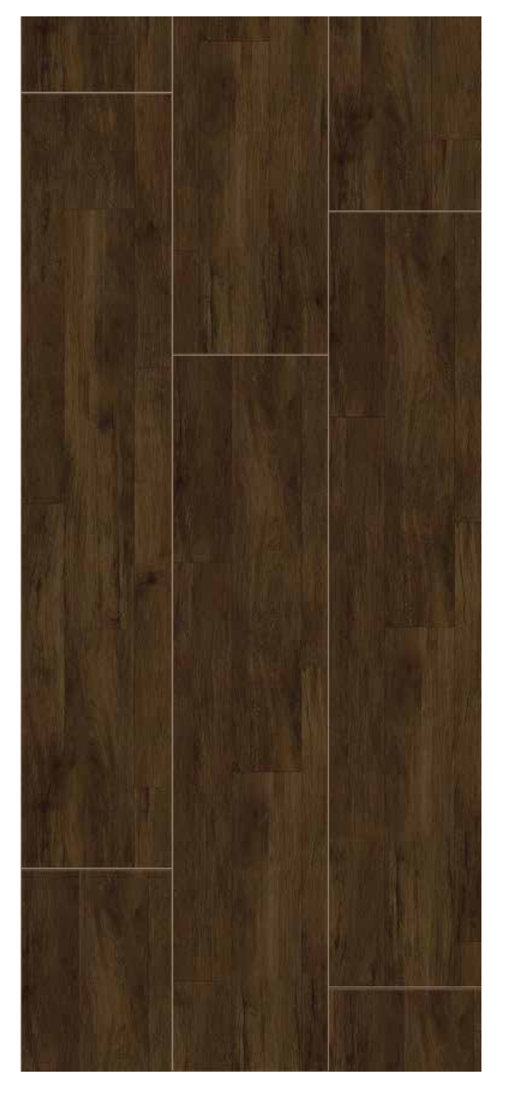
1131_Trend Parkett Brown